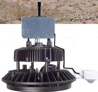
EverLast Legend Series Custom Occupancy Sensor Option