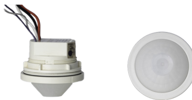
MULTIPLE SENSOR OPTIONS

OF = On / Off sensor option BL = Bi-Level sensor option DH = Daylight Harvesting sensor option