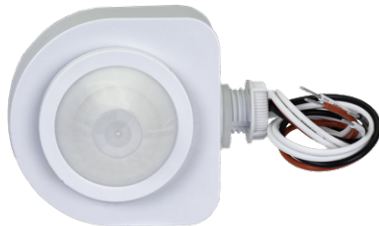
OF / BL / DH

On-Off / Bi-level / Daylight harvesting sensor options.