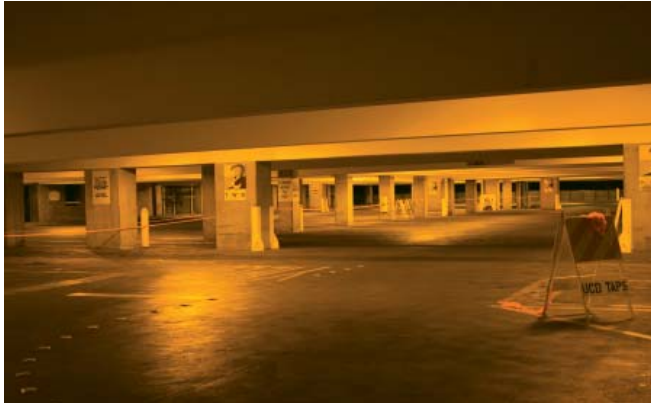
FIGURE 2: PRE-RETROFIT LIGHTING—HIGH PRESSURE SODIUM North Entry Parking Structure, UC Davis

The TAPS funded project cost under $1 million, with a $325,000 rebate from the Energy Efficiency Partnership. UC Davis' annual electrical energy savings are expected to reach 1.3 million kWh. The retrofit was part of the UC Davis Smart Energy Initiative, an agreement between CLTC, UC Davis Facilities Management, and the Energy Efficiency Center to increase safety, save energy, and reduce maintenance costs on campus.