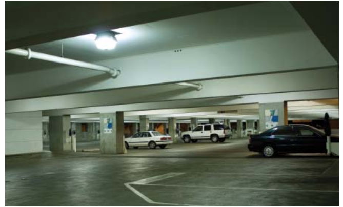
FIGURE 3: POST-RETROFIT LIGHTING—INDUCTION North Entry Parking Structure, UC Davis

been retrofitted with bi-level induction parking luminaires and a Wireless Interface for Photosensor and Motion Sensor system (WIPAM).